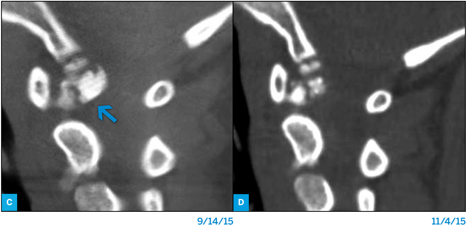
Figure 2: Sagittal view at baseline (C) and 2 months later (D) showing fragmentation and partial dissolution of the mass.