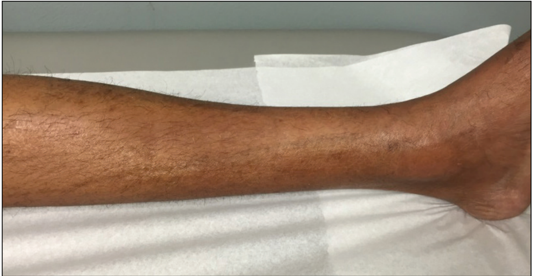
Figure 1: Photograph of the left leg demonstrating a “groove sign” along the path of a superficial vein.