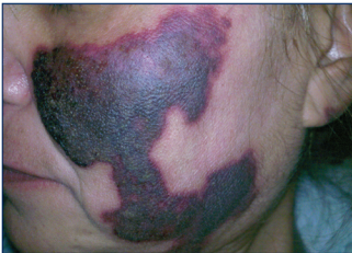
Figure 2: Deep purple lesions on cheek.