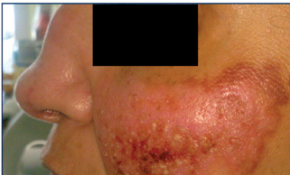
Figure 3: Saddle nose deformity. Resolving retiform purpura on cheeks.