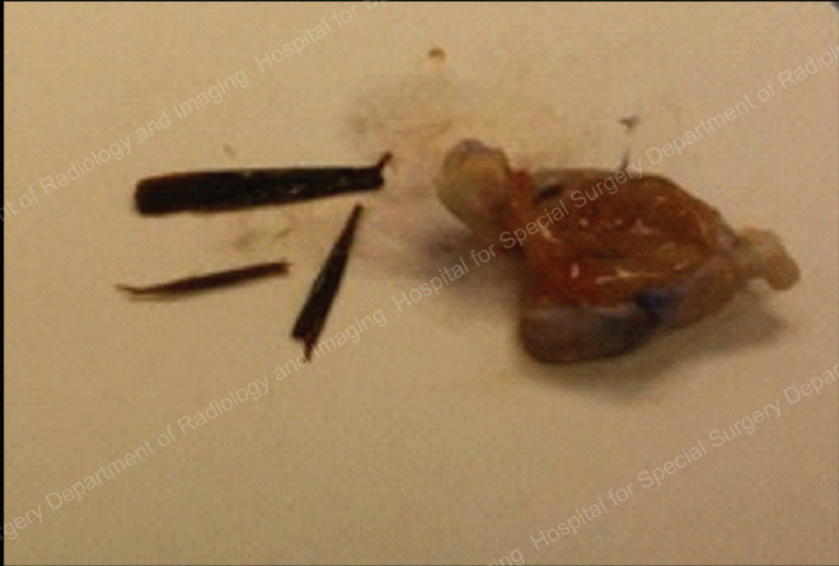
Inflammatory soft tissue mass removed containing multiple wooden splinters