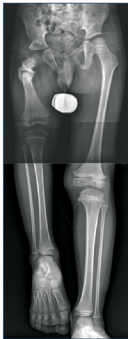
Figure 1: Radiograph of initial presentation of right Congenital Short Femur with 14cm of shortening. This shows a healed pelvic osteotomy, and intertrochanteric osteotomy with radiographic evidence of a nonunion and significant varus angulation.