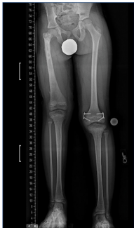
Figure 5: After removal of TSF and contralateral distal femoral epiphysiodesis with residual 8cm discrepancy.