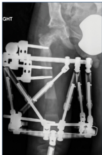
Figure 4: After femoral diaphyseal osteotomy, TDSF application and 5cm lengthening.