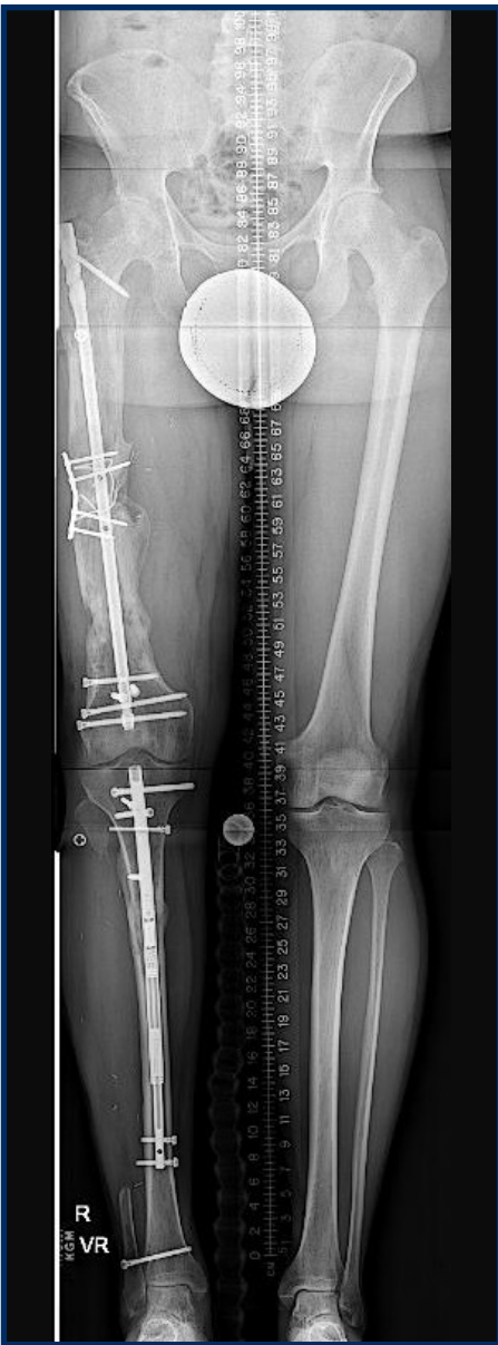
Figure 3 – Follow-up standing x-ray showing equal leg lengths following femur reconstruction and tibial lengthening with a motorized IM nail.