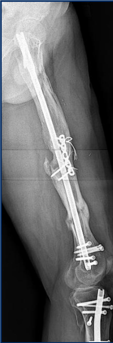
Figure 4 – Follow-up lateral x-ray of the femur showing bone union following trifocal bone transport.