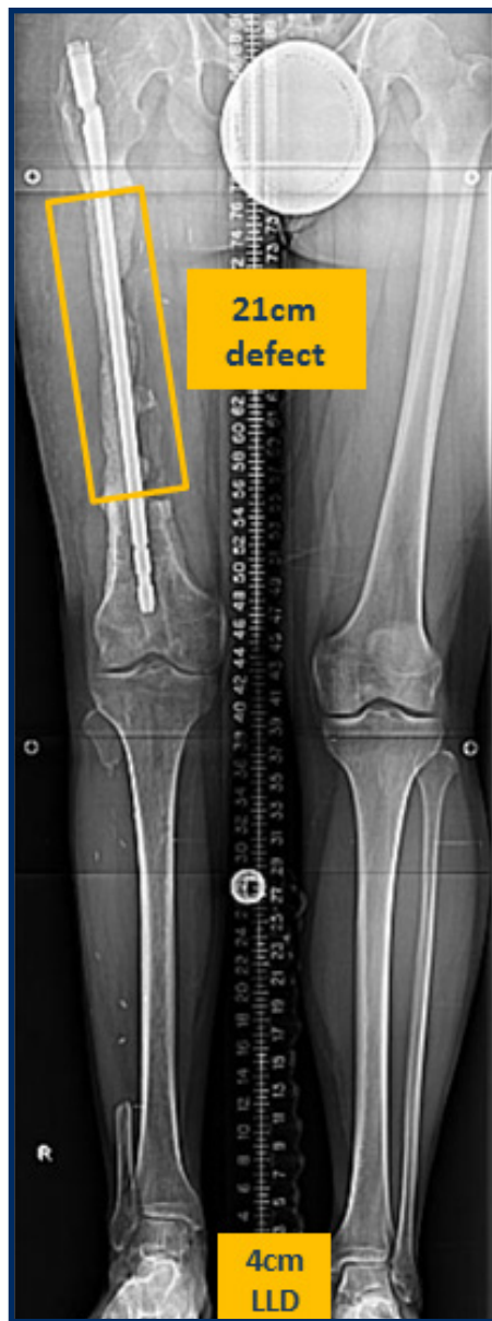
Figure 1 – Preoperative x-ray showing a 21cm femur defect spanned with IM rod and cement plus additional LLD of 4cm.