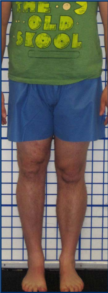
Figure 5 – Follow-up clinical photo showing normal alignment and equal leg lengths.