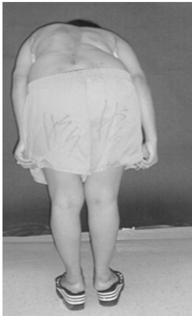
Figure 3. Postoperative photograph shows the balance correction achieved in the frontal and sagittal planes.