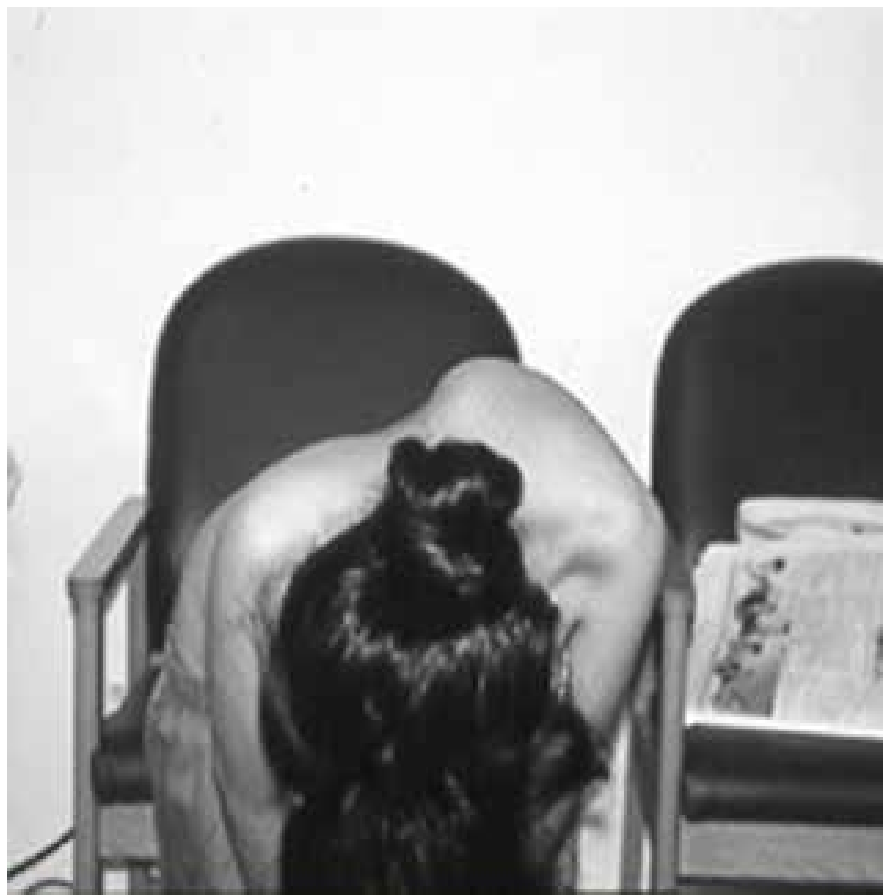
Figure 1 – Pre-operative photographs of the patient showing the severity of the scoliosis and kyphosis.