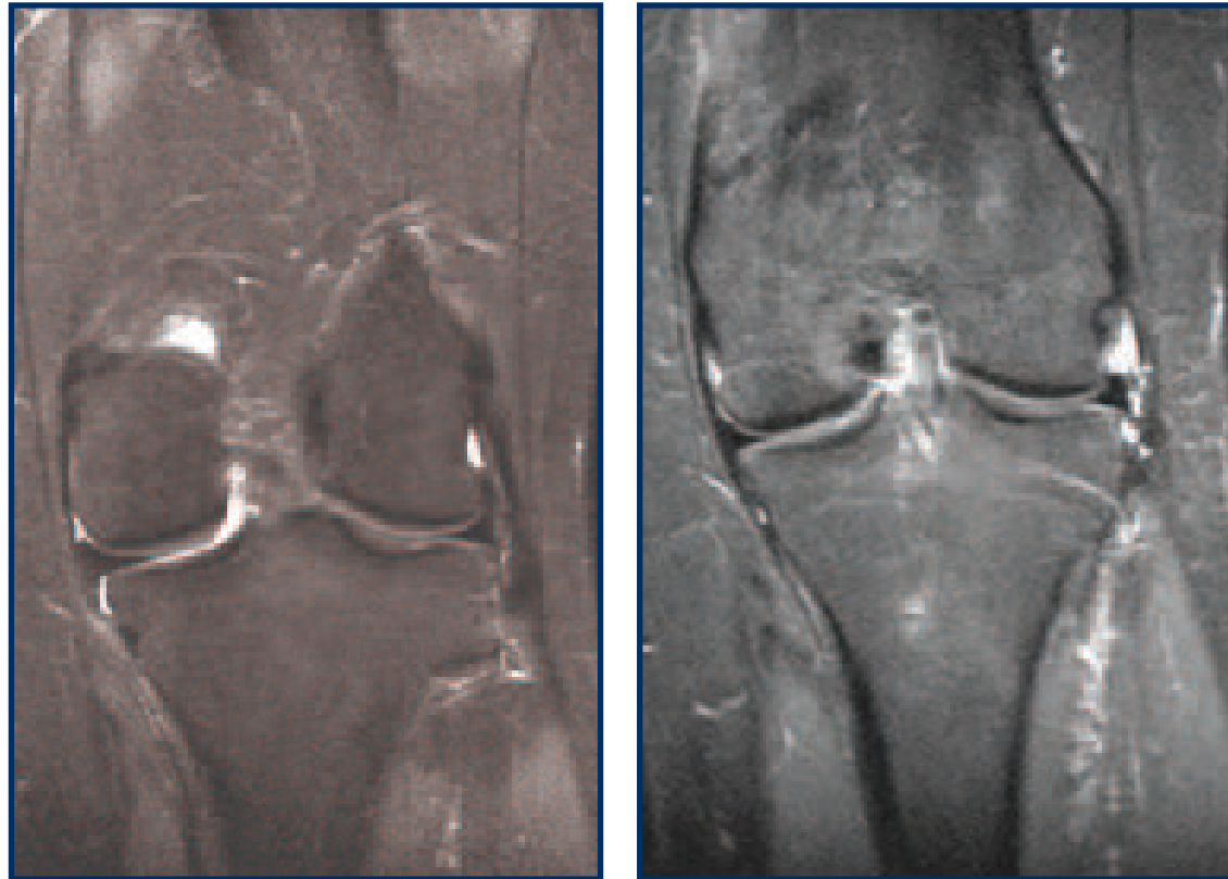
Figure 2 – Pre-operative (left) and post-operative (right) coronal STIR MRI images. The injury MRI shows extrusion of the medial meniscus consistent with root detachment. The post-repair image on the right shows no evidence of meniscal extrusion.