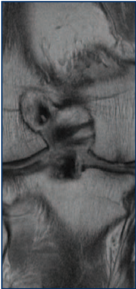
Figure 3 – Pre-operative MRI showing femoral ACL tunnel widening.