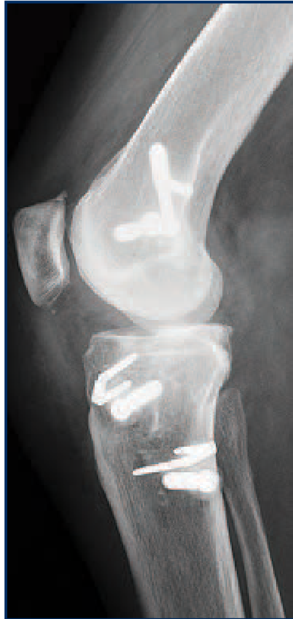
Figure 4 – Pre-operative radiograph demonstrating ACL tunnel enlargement.