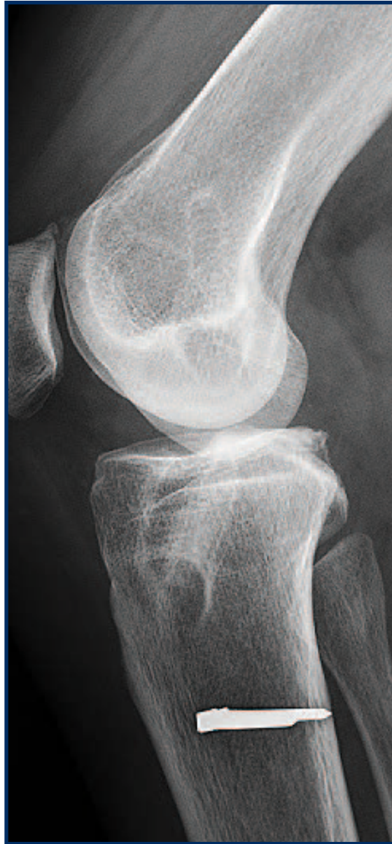
Figure 1 - Pre-operative radiograph demonstrating ACL tunnel enlargement.