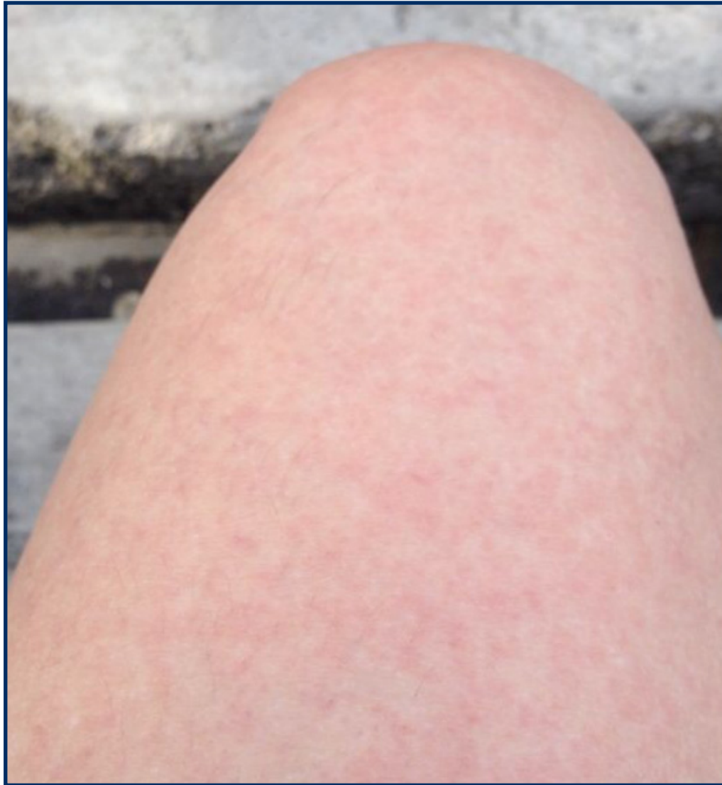
Figure 1 – Erythematous maculopapular rash on thigh.