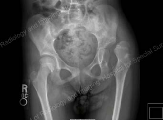
Fig. 1: AP x-ray demonstrating a dysplastic, dislocated left hip and coxa valga (abnormal alignment) of the right hip.