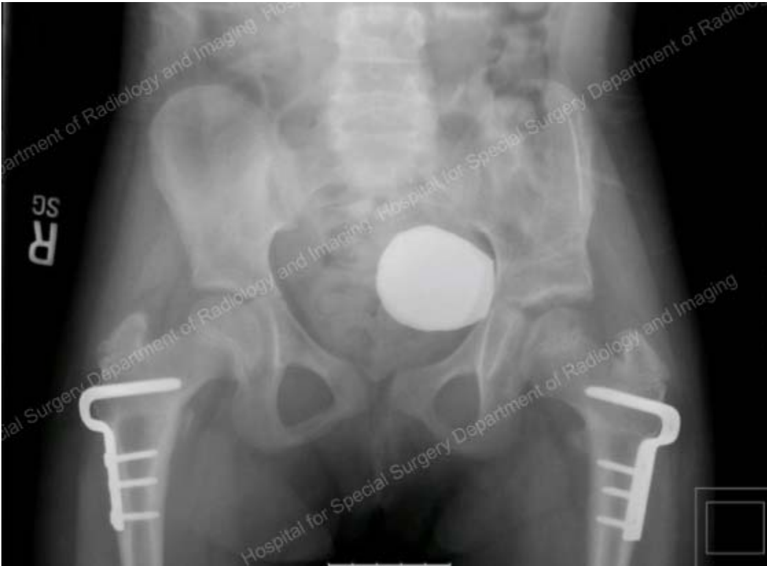
Fig. 3: Post operative AP x-ray obtained 1 year post left pelvic osteotomy and bilateral VRO demonstrating that both hips are located.