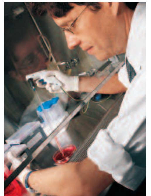
Lionel B. Ivashkiv, MD

The chemical pathway involves the body’s responses to potent substances called cytokines, a group of proteins that have a dramatic influence on the progression, or reversal, of diseases such as rheumatoid arthritis or lupus. While doctors have long known that cytokines can regulate diseases such as