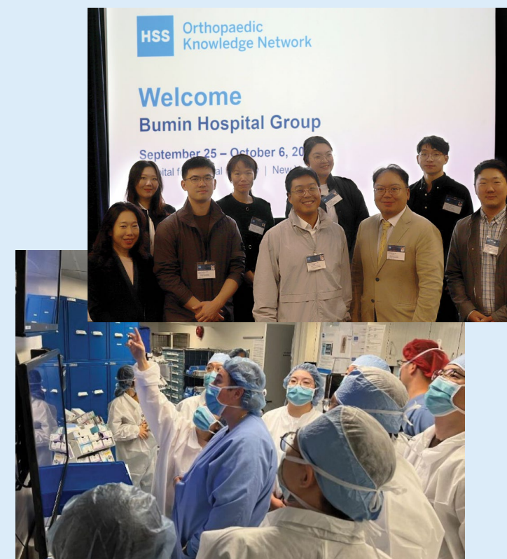
Bumin Hospital Group visited HSS, September 2023