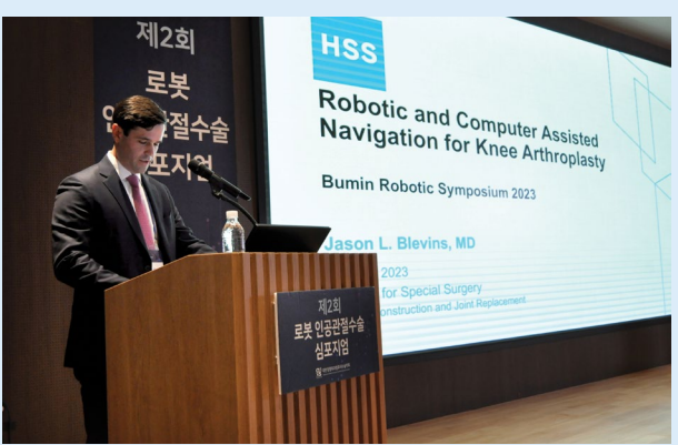
Bumin Robotic Surgery Symposium 2023