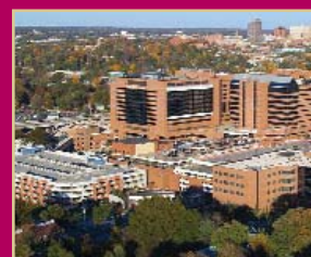
Wake Forest Baptist Medical Center