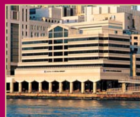
Hospital for Special Surgery

The 14th Annual Controversies and Fundamentals in Regional Anesthesia features faculty from the Hospital for Special Surgery in New York City and guest faculty from Wake Forest University Baptist Medical Center in North Carolina.