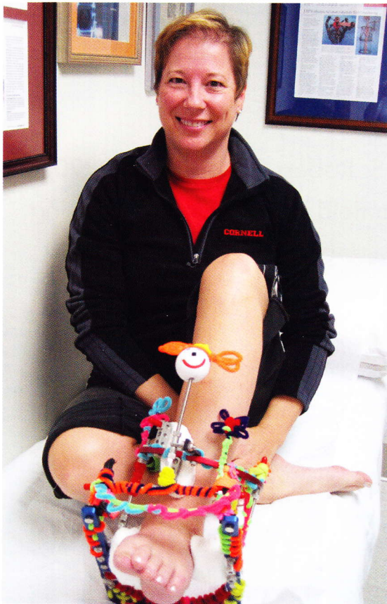
HOSPITAL FOR SPECIAL SURGERY